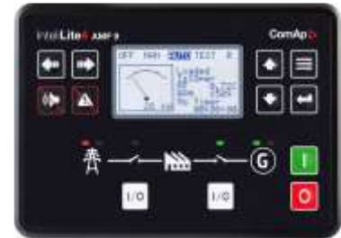
IntelliLite 4 AMF 9