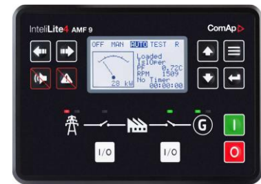
IntelliLite 4 AMF 9